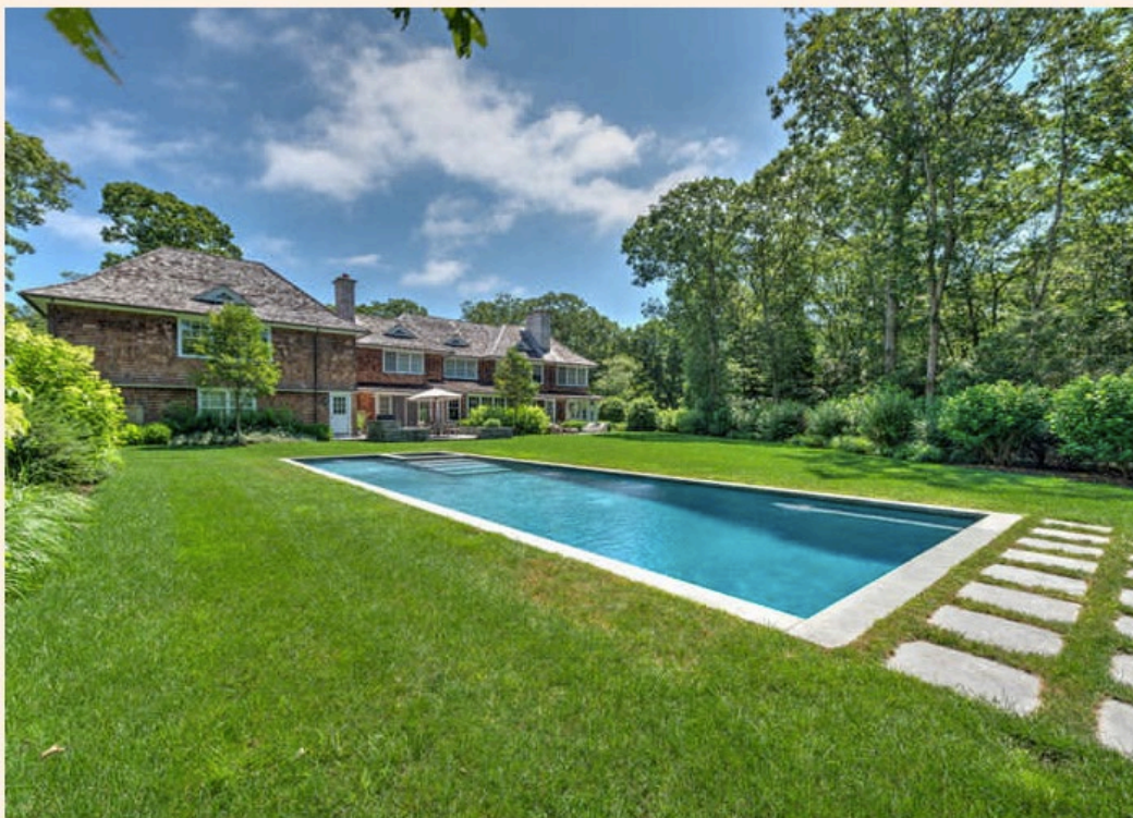
A house in the Hamptons let by StayMarquis"

The Landmark Trust, a charity which offers holidays in historic buildings, also reports strong short-notice demand. Following Johnson's speech on Monday it took bookings for the Martello tower, a defensive fort in Aldeburgh, Suffolk, whose walls are more than two metres thick, and the China Tower, a castellated octagonal tower surrounded by forest in Devon. The charity says it has enhanced cleaning at its properties, including the use of virucidal disinfectants. In the US, New York-based luxury rental company StayMarquis says it is seeing an "unprecedented influx" of what it calls "Doomsday bookings". It offers more than 600 homes in the Hamptons, Hudson Valley and Berkshires, and says bookings increased tenfold in the past week, driven by families cancelling trips overseas and wanting to escape the city. Its more expensive properties have been most in demand and renters have been requesting a "right of first refusal", giving them the chance to extend their stay if someone else tries to book it for the subsequent period.